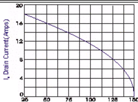
Tc. Mos Case Temperature( C) Maximun Drain Current Vs.Case Temperature on Power Mos.